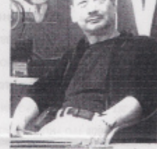
MARCEGERMANY © 2009

http://www.rvosukecohen.com/board/ton.html